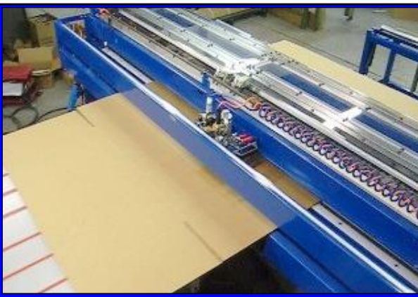
Outfeed, with optional PUNCH

EZ Box Machinery Co., Inc. 709 Performance Road Mooresville, NC 28216 USA Ph 704-399-0727; Fax 704-875-8080 www.ezbox.com Brochure #970B (111017)