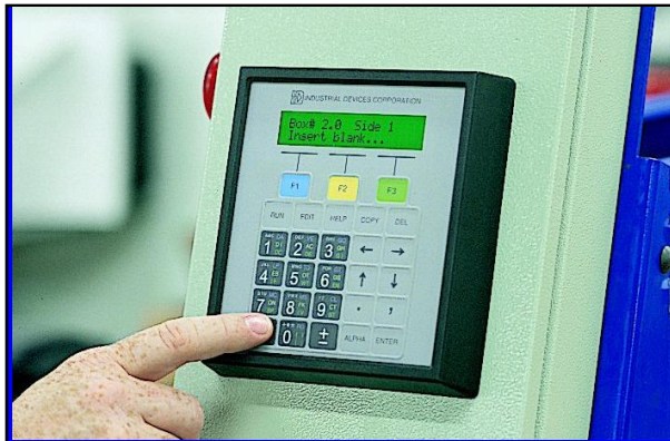
Setup 0201, RSC